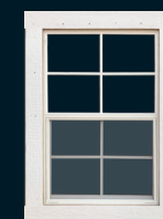
2'x3' Window $90.00