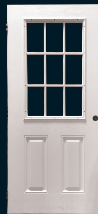
36" Solid Door $275.00