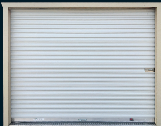
6' Roll-up Garage Door $525.00