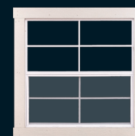
3'x3' Window $105.00